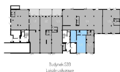
Budynek 53B Lokale usługowe

Wszystkie informacje mają charakter poglądowy. W celu przedstawienia i realizacji inwestycji należy skontaktować się z biurem nieruchomości.